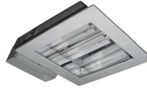
Anodized Aluminum Louvre