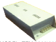
MODEL: TFM 280/100/W TRANSFORMER BOX **For PLC FTG**