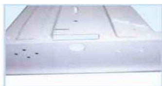
Air slot for extraction