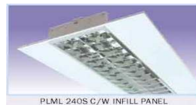
PLML 240S C/W INFILL PANEL